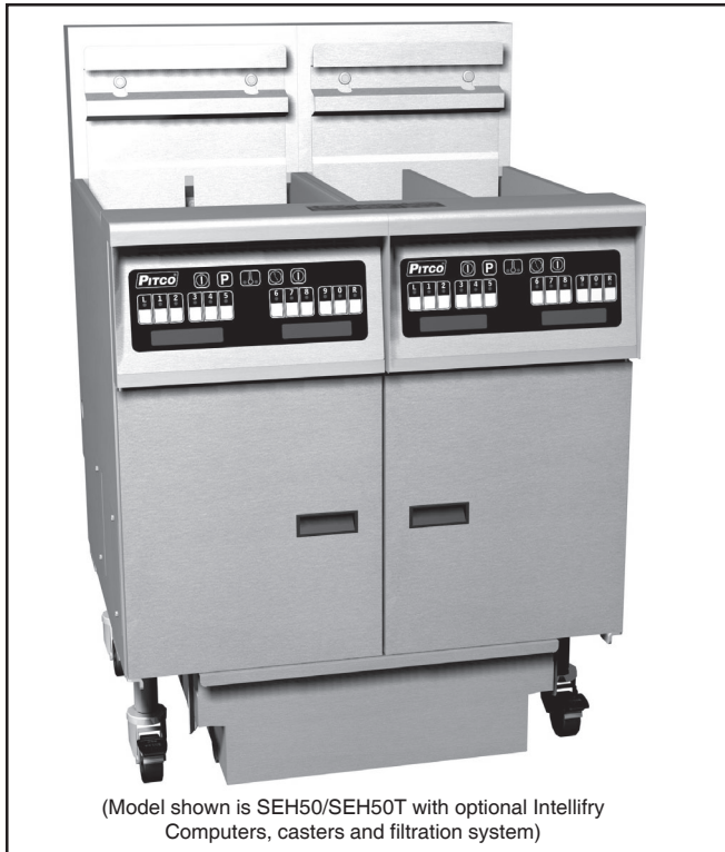
(Model shown is SEH50/SEH50T with optional Intellifry Computers, casters and filtration system)