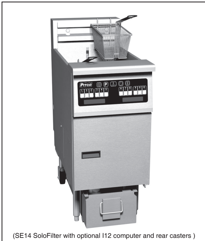
(SE14 SoloFilter with optional I12 computer and rear casters )