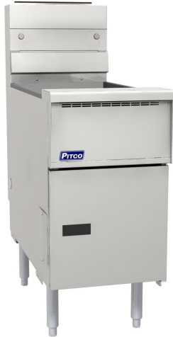
SG14R w/ optional SSTC