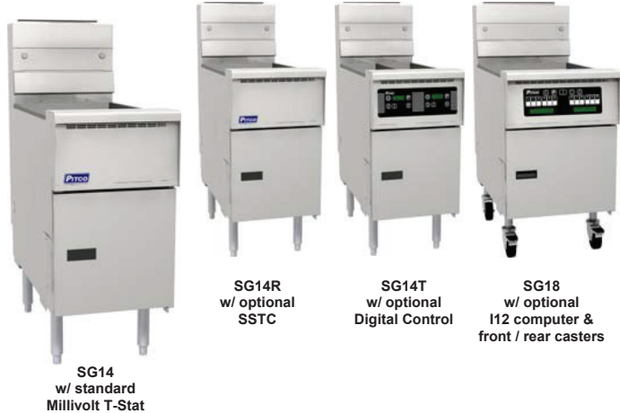
SG14 w/ standard Millivolt T-Stat

For High Production Gas frying specify Pitco Solstice Gas Models SG14, 14R, 14T or SG18 tube fryers with the patented Solstice Burner Technology. The dependable blower free atmospheric heating system provides fast recovery to cook a variety of food products. The Solstice gas fryer comes standard with a millivolt thermostat, for melt cycle and boil mode choose the optional quick responding solid state thermostat with the matchless ignition system. The optional digital control and the elastic time computer are available and can be used with our optional labor saving highly reliable basket lift system. The patented self cleaning burner and down draft protection keeps your fryer tuned up for peak daily performance.