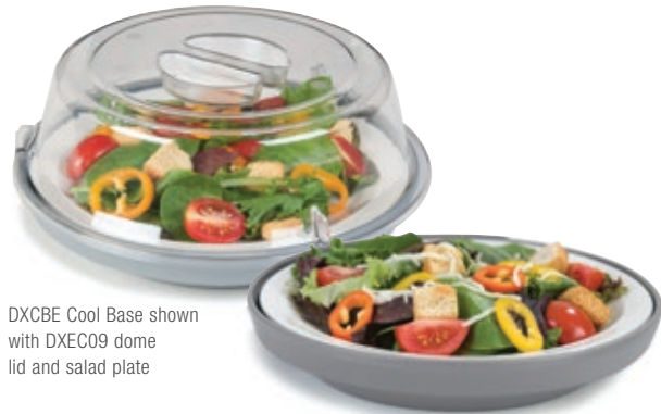
DXCBE Cool Base shown with DXEC09 dome lid and salad plate