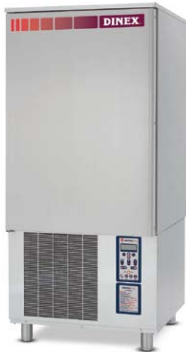
Item Number: DXDBC110