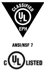
Item Number: DDXBC70