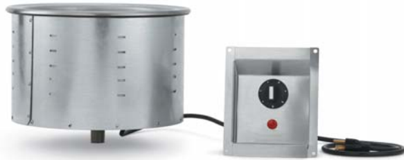
Modular Drop-In: Soup Well