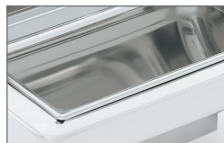
Dripless Water Pan