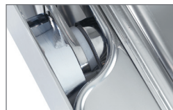
Breakthrough Hinge Design