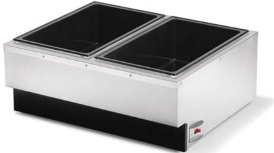
Cayenne® Dual Warmer