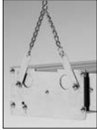
Standard mounting tabs. See back page for other mounting options.