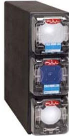
LidSaver™ Only Shallow Depth Cabinet