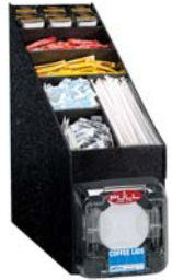
LidSaver™ Cabinet with Straw and Condiment Organizer