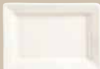
8" x 5 1/2" Rectangular Plate No. SL-20 H1 2 doz • 25#/.6 cu ft