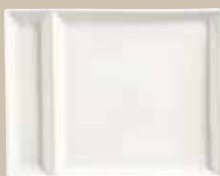
9" x 7" Plate, Cocktail No. SL-900 H 7/8 2 doz • 33#/.7 cu ft Also shown on p. 45.