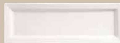
16" x 5 1/2" Rectangular Plate No. SL-22 H1 1 doz • 26#/.6 cu ft