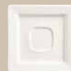
5 1/8" Square Saucer w/well ring No. SL-2 H 5/8 3 doz • 23#/.5 cu ft