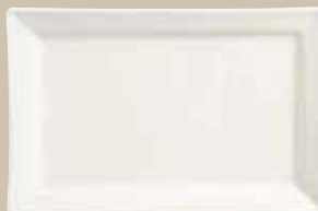
12" x 8" Rectangular Plate No. SL-26 H 7/8 1 doz • 28#/.6 cu ft