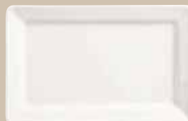
11" x 7" Rectangular Plate No. SL-27 H 7/8 1 doz • 22#/.4 cu ft