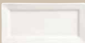
12" x 6" Rectangular Plate No. SL-23 H 7/8 1 doz • 22#/.4 cu ft