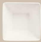
5 1/2" - 20 oz. Square Bowl No. SL-19 H 2 5/8 2 doz • 29#/.8 cu ft. Fits Saucer No. SL-29