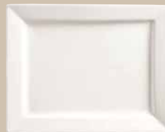
14" x 11" Rectangular Plate No. SL-25 H 1 1/8 .5 doz • 31#/.9 cu ft