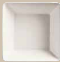
8" - 50 oz. Square Bowl No. SL-50 H 2 1/2 1 doz • 31#/.9 cu ft. Fits Versa-Riser No. VR-3