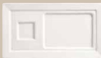
14" x 7 1/4" Soup & Sandwich Tray No. SL-29 H 3/4 1 doz • 31#/.7 cu ft