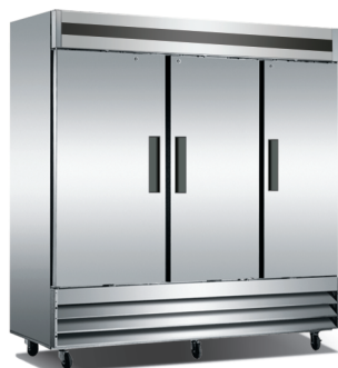
Mdl CFD3RR-72 Mdl CFD3FF-72