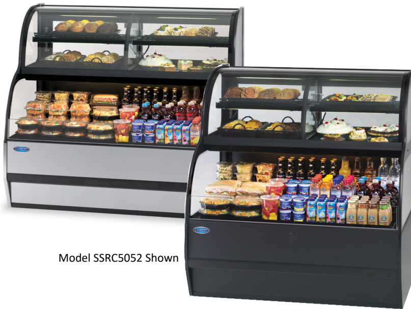
Model SSRC5052 Shown

Display a variety of products and serve more customers with pre-presentation and value in mind.