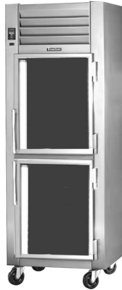
Model RHT126WPUT-HHG (shown with optional fluorescent lights & casters)