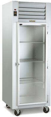
Model RHT126WPUT-FHG (shown with optional casters)