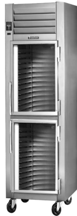
Model RHT132DUT-HHG (shown with optional interior arrangements & casters)