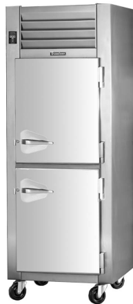
Model RHT132WPUT-HHS (shown with optional casters)