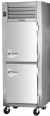
Model RHT132WPUT-HHS (shown with optional casters)