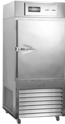
Model RBC100 (shown with optional casters)

Like all blast chillers, Traulsen's model RBC100 is designed to quickly cool its respective capacity of hot product through the HACCP danger zone as fast, or faster, than any other equivalent brand on the market (approximately 90-minutes). However, in addition to the outstanding cabinet construction synonymous with Traulsen, what differentiates these models from competition is the operational flexibility and labor savings inherent in their easy-to-use controls, automatic HACCP documentation, and a variety of operator friendly features, such as our exclusive "By-Product" chill mode.