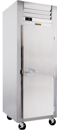
Model Shown One Section (shown with optional casters)