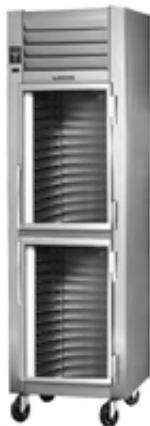
Model RHT132DUT-HHG (shown with optional interior arrangements & casters)