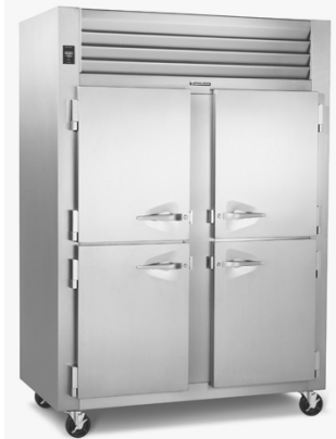
Model RHT232WUT-HHS (shown with optional casters)