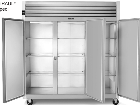
Model AHT332NUT-FHS (shown with optional casters)