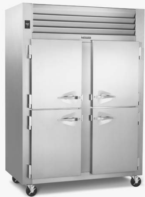
Model RHT232WUT-HHS (shown with optional casters)