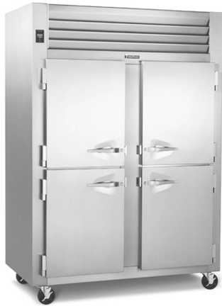
Model RLT232NUT-HHS (shown with standard left/right hinging and optional casters)