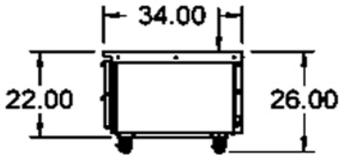
Section - All Models