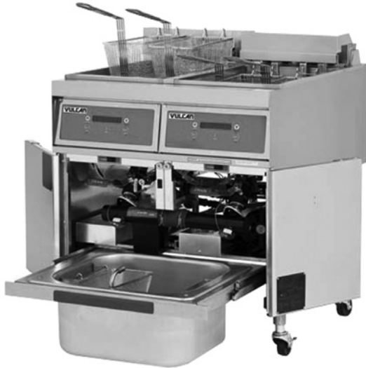
Model 2ER85DF Shown on casters (Accessory)