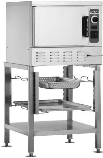
Shown on optional stand with extra set of pan slides and pans