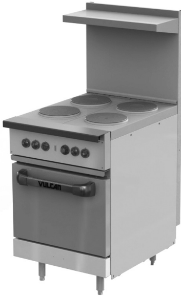
Model EV24S-4FP208 shown with adjustable legs