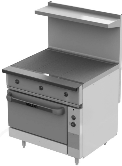
Model EV36S-3HT208 shown with adjustable legs