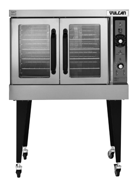
Model SG4 Shown on optional casters