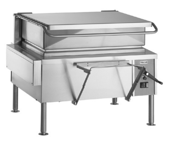
Shown with enclosed faucet bracket