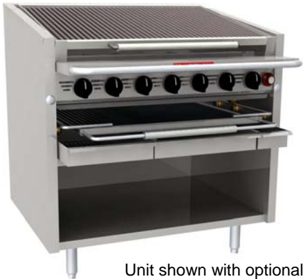
Unit shown with optional lower rack