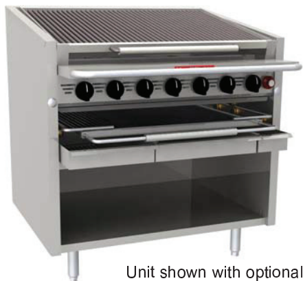
Unit shown with optional lower rack