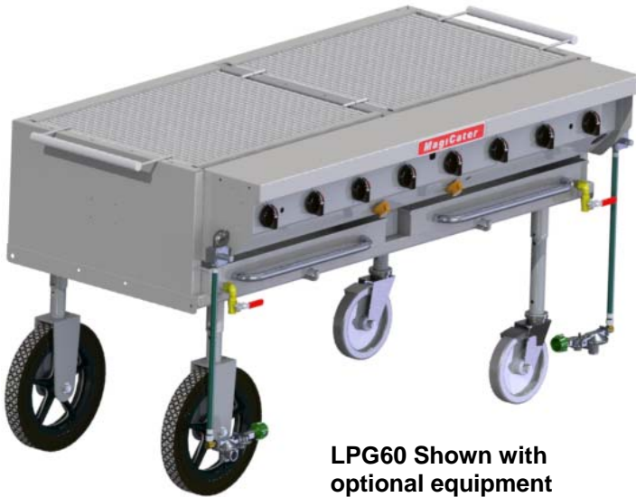
LPG60 Shown with optional equipment