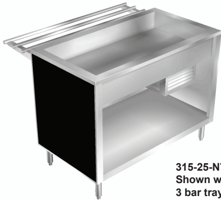
315-25-N7 Shown with optional 3 bar tray slide