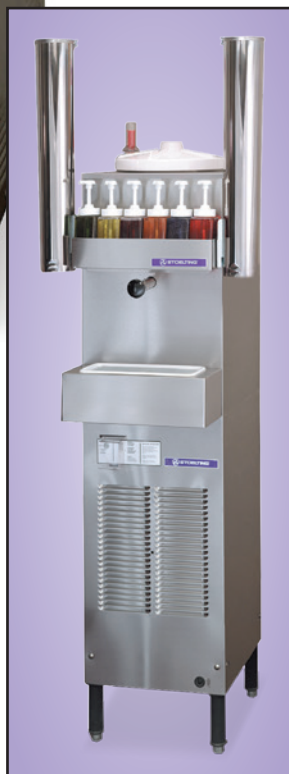
E257 Floor Model