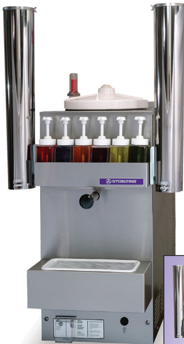
E157 Counter Model