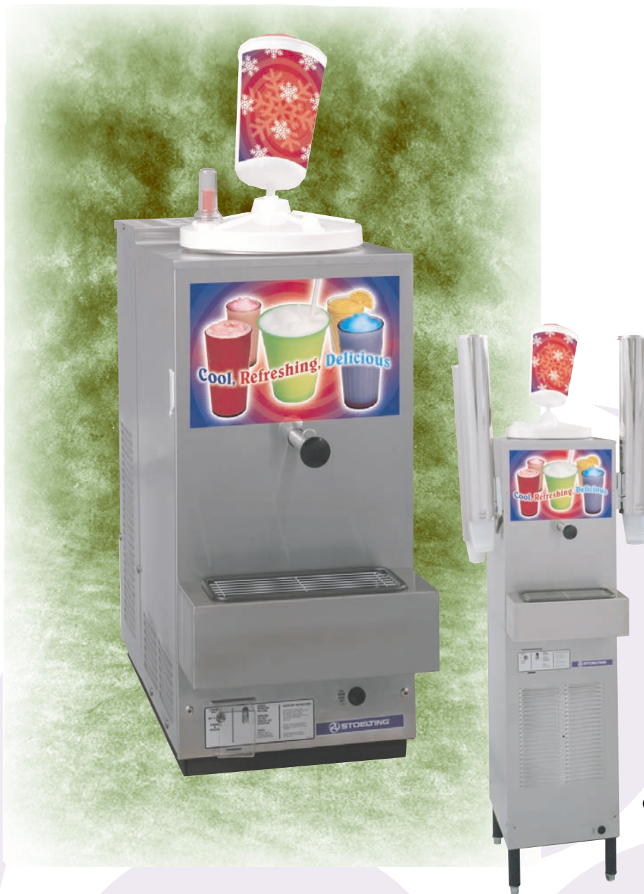
LE257 Floor Model depicting optional cup holders