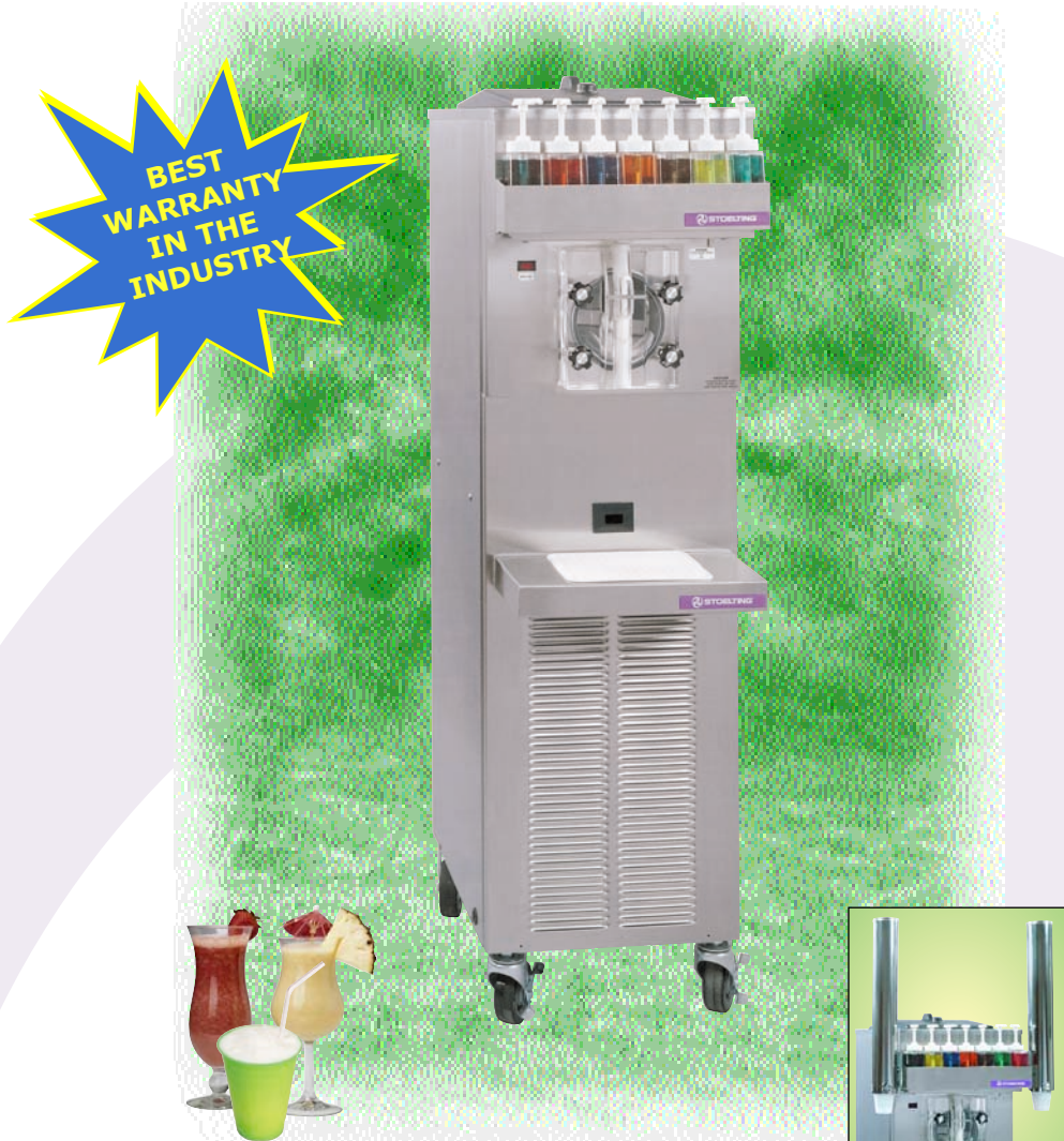
Optional Cup Holders Depicted