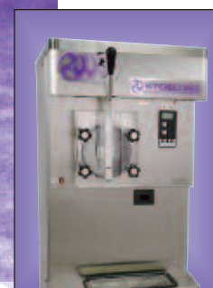
Model U412 (without mixer).