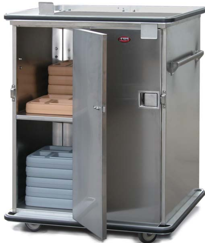
ETC-1314-64 (Trays not included)

"Correctional Quality" – Heavy-duty stainless steel transport serves insulated trays efficiently, securely, and at less cost!