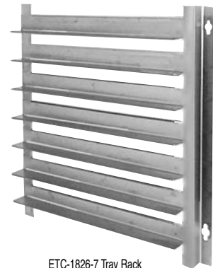
ETC-1826-7 Tray Rack with 3" Fixed Spacings (One side of a pair)

FWE's non-insulated all stainless steel transport is built tough for all purpose transport and storage.