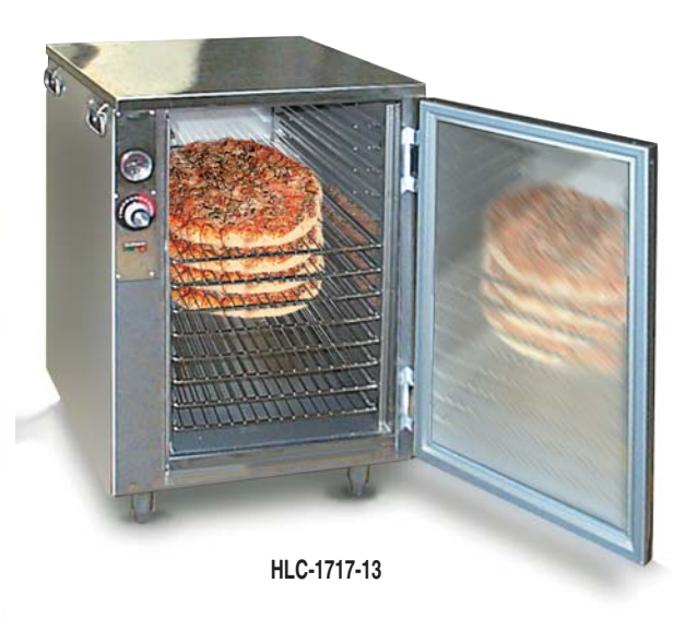
Compact holding cabinet or a display merchandiser, this versatile unit can hold profits for your bakery to pizza program. 13 shelves hold almost anything!