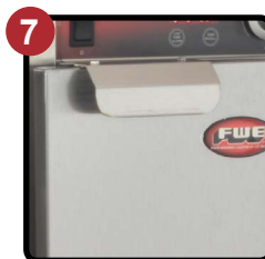
Work Flow Handle