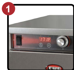
Individual Heat Controls

(Shown with Cutting Board Work Top and Tubular Push Pull Handle Optional Accessories)