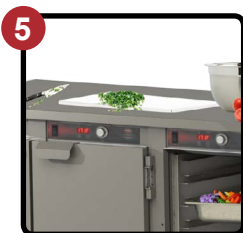
Stainless Steel Work Top