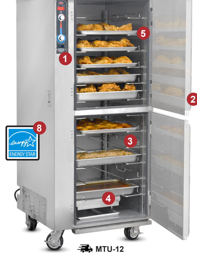
(Shown with Optional Accessory Dutch Doors)