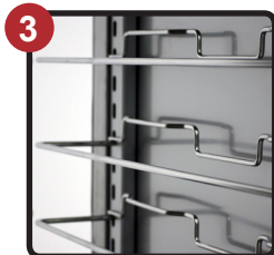
Adjustable Tray Slides