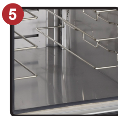
Open Bottom Base