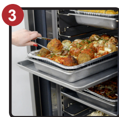
Adjustable Tray Slides