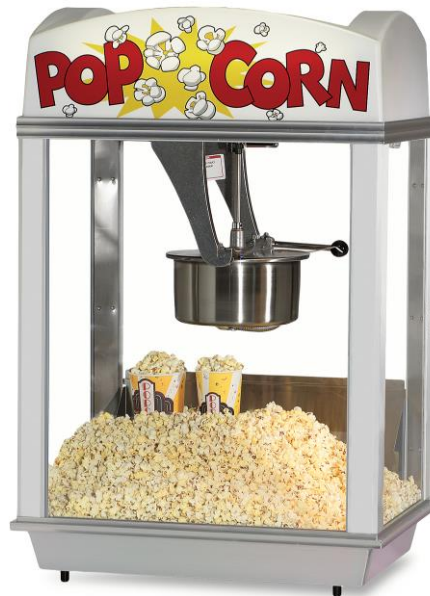
General reference image shown.